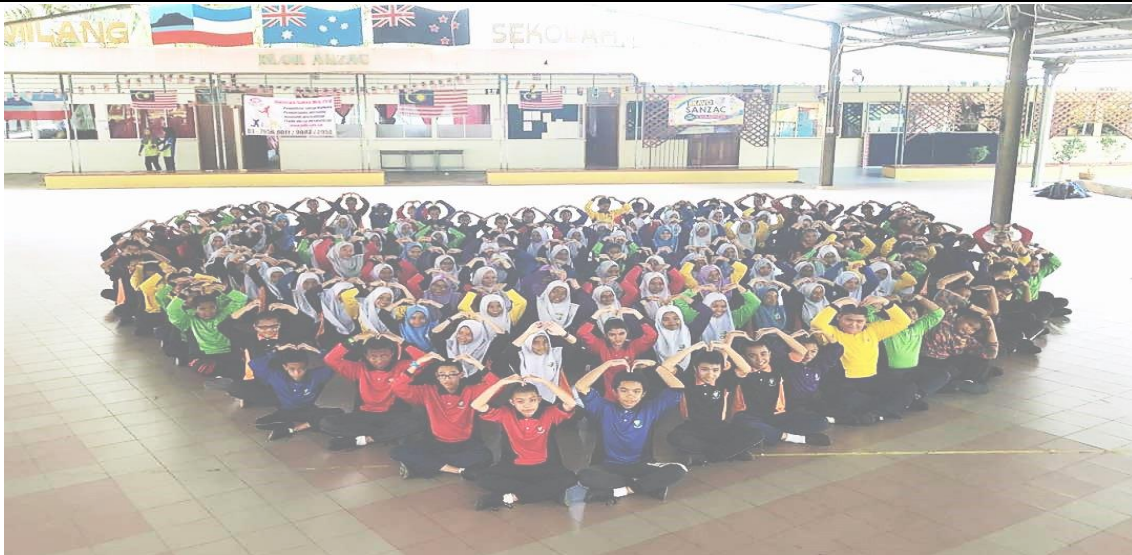
Photo 2: A heart-shaped formation expressing LOVE and Peace in SMK SANZAC