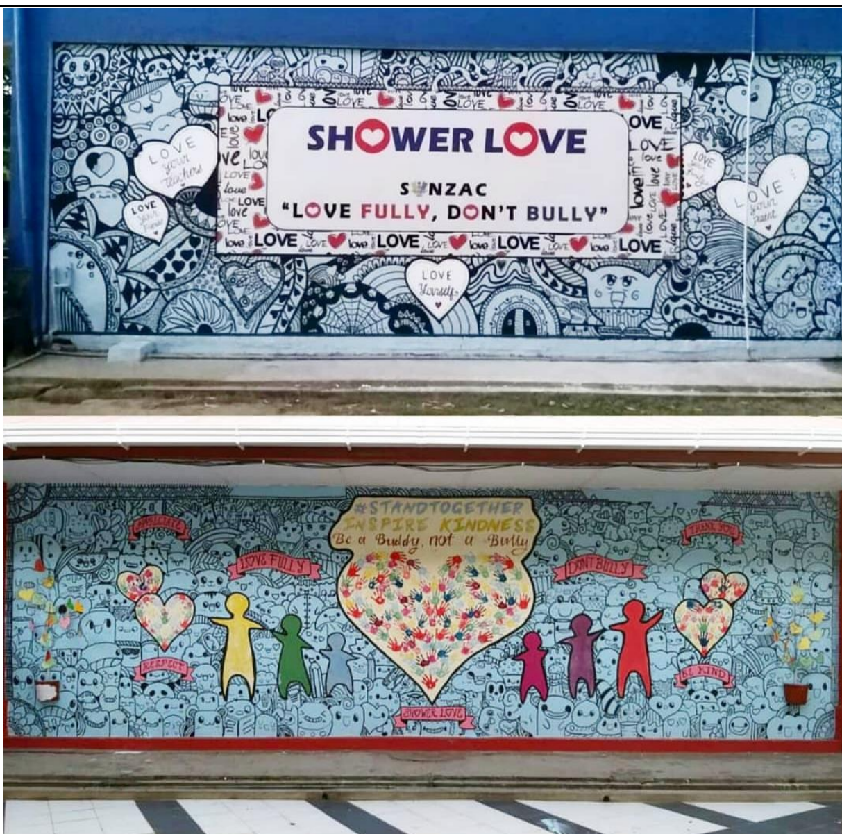
Photo 3: Impactful mural created by school Principal, teachers, students and parents.