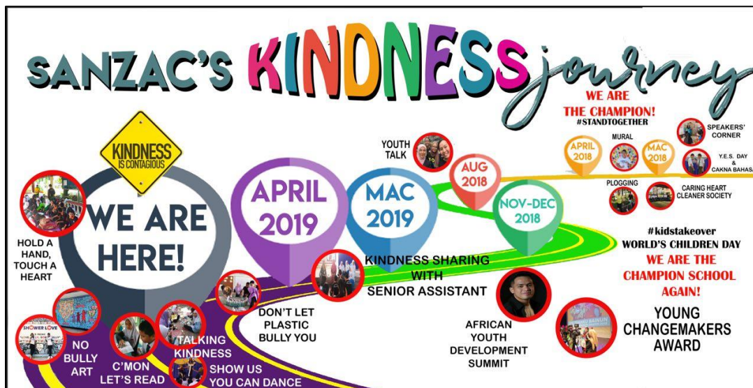
Photo1 :A Banner of SMK SANZAC's Initiatives to Promote Peace in school and the community

Document 5) Folder 5: SMK SANZAC's Compilation of Successes