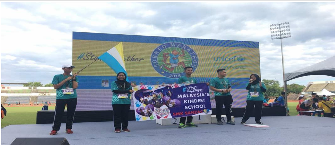
Photo 4: Students recounting their journey to being crowned Malaysia's Kindest School at the UNICEF Borneo Marathon, 2018.