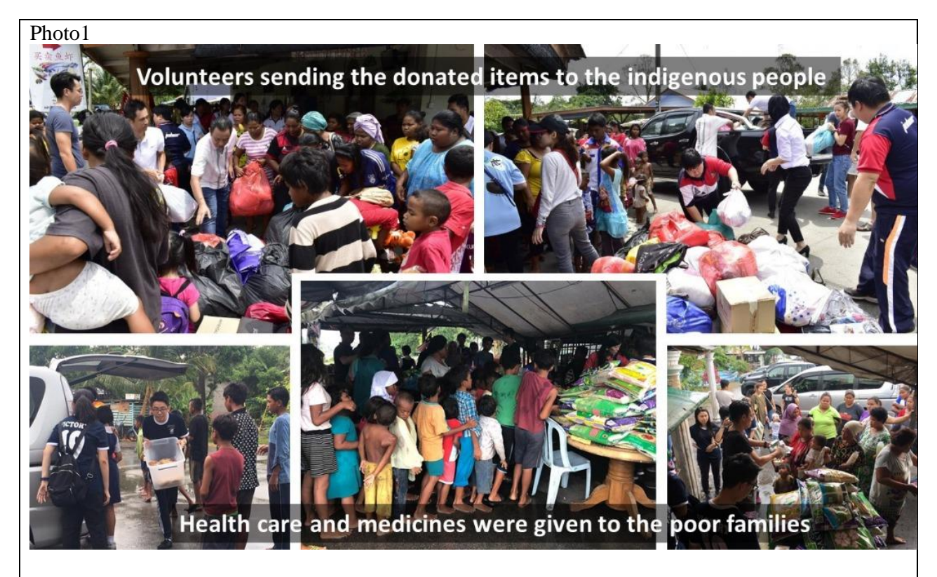
'We Share, We Care 1.0'. Donated items such as old clothes, toys and school necessities were given to the less fortunate. In 'We Share, We Care 2.0', staple food, medicines and health care products were given to the poor families to sustain life.

18. Photos related to the activity/programme (Maximum of 5 photos with captions in English)