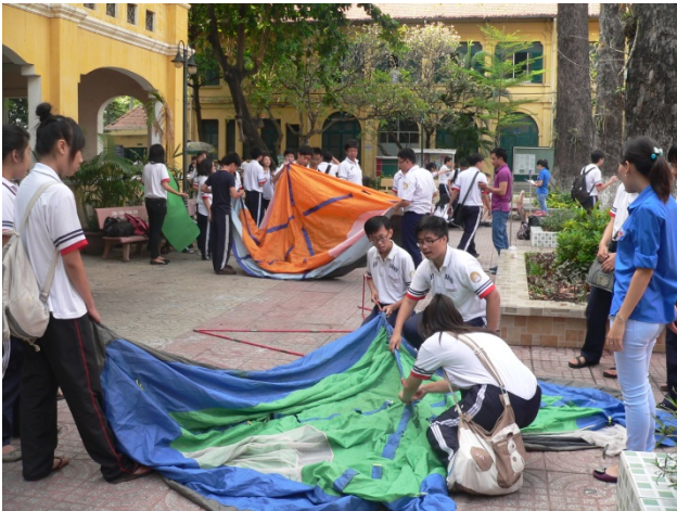
The decorating tent test