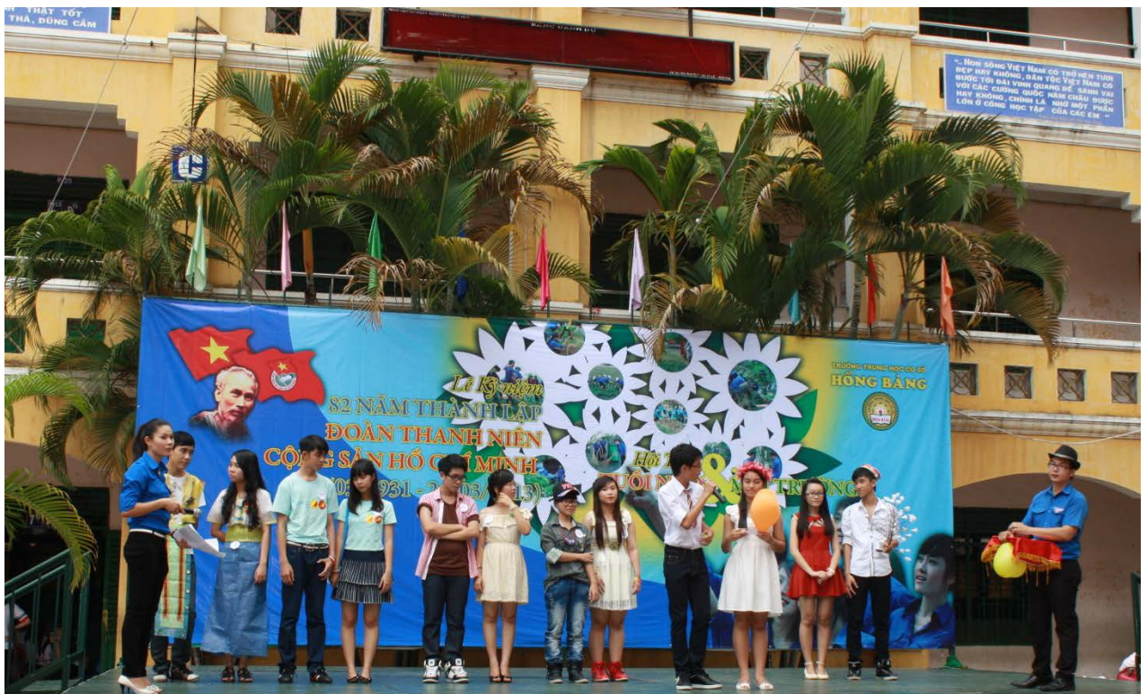
The elegant fashion contest with recycled accessories