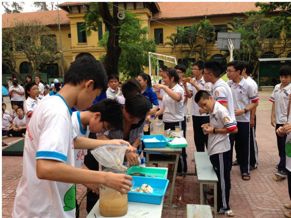
The motive test of "bring fresh water to delta"